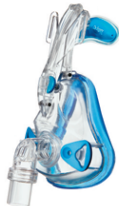
NovaStar® TS NIV full-face mask with Standard Elbow