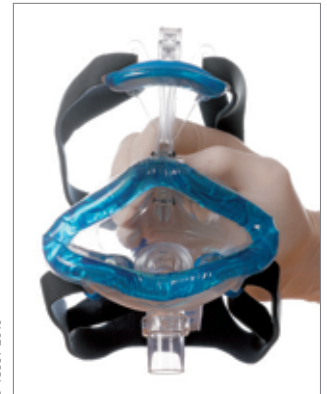
Pliable and adjustable forehead support – mask stays in position